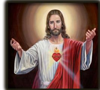
Sacred Heart Church Bayard, NE 69334