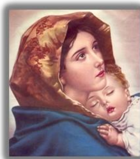
St. Mary's Church Dalton, NE 69131